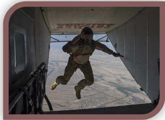
Table 4 Principal Activities at Marana Regional Airport

The Marana Regional Airport supports area businesses and a wide spectrum of aviation activities. Aviation activities include recreational flying and parachuting as well as aerial surveys, law enforcement flights, military exercises, aerial advertising and flight training. The airport helps improve the quality of life in Marana by supporting emergency medical evacuations as well as community activities. The Marana Regional Airport also serves as a gateway for visitors to resorts and attractions in Marana and surrounding cities.